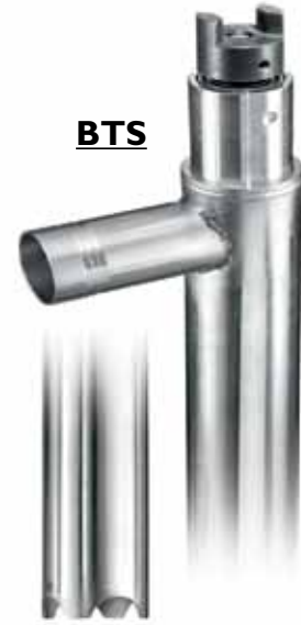
Tube Length 40" (102cm)