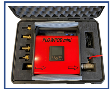
Available Travel Case with interior compartments for Flowpod Mini & Accessories