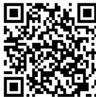
Understanding readouts when there are readings