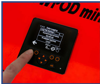
Internal Data Logger