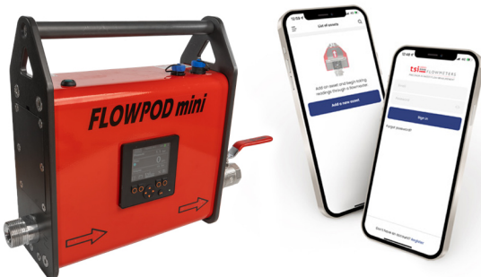
TSI Mobile App Link your Flowpod Mini to the app via bluetooth for Data Collection and Cloud Storage