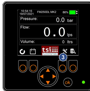
All Information On One Display