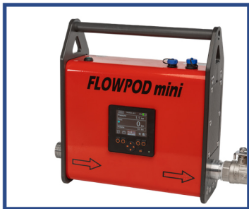
Lightweight & Portable