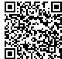
Flowpod Mini playlist