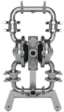
PS4 HS METAL

38 mm (1-1/2") Pump Maximum Flow Rate: 357 lpm (94.4 gpm)