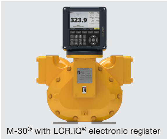
M-30 ® with LCR.iQ ® electronic register