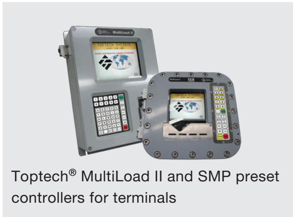
Toptech ® MultiLoad II and SMP preset controllers for terminals