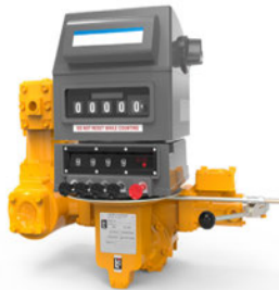
M-5 class 4 meter with register and printer

Potted, treated, deionized, and demineralized Water, Windshield Washer Fluid and Solvents where no red metals are allowed