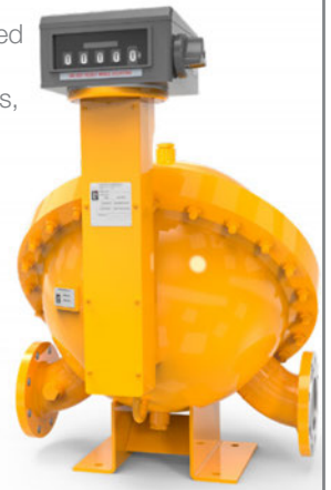
MSAA-75 class 14 meter with mechanical register