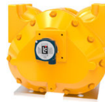
M-30 class 14 meter with POD for LCR.iQ

Crude Oil, LACT, NOD, Heated and/or Viscous Liquids Including: Animal Fats, Resins, #6 Oil, Non-Abrasive Asphalt Emulsions