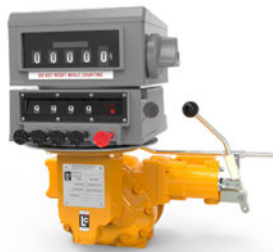
M-7 class 3 meter with mechanical register

Liquid Sweeteners and Syrups, Dextrose, Fructose, Sucrose, Maltose, Lactose. Corn Oil, Soy Bean, Cotton Seed and Coconut Oils, Shortenings