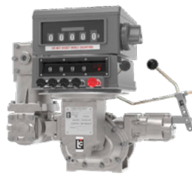
M-7 class 8 stainless steel meter with register

Acidic pH Liquids, Nitric, Phosphoric and Glacial Acetic Acids, Fruit Juices and Vinegar, Distilled Water