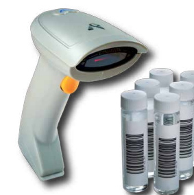
Barcode Reader (197-00021-1)