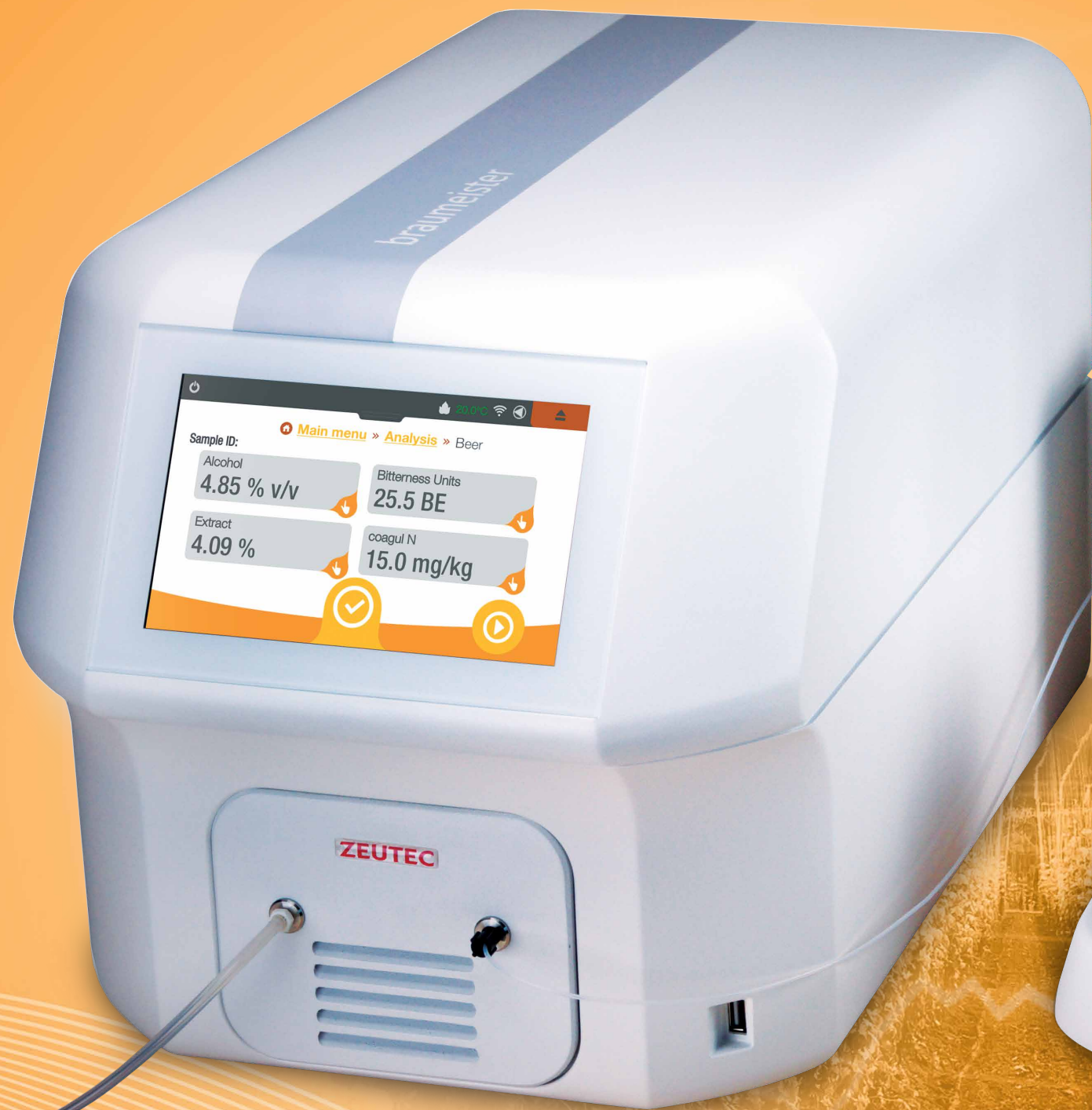
SpectraAnalyzer® braumeister with AutoSampler