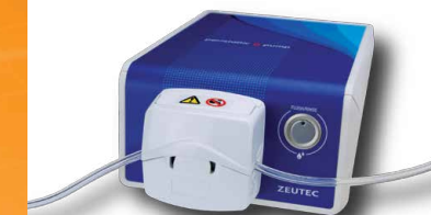
Peristaltic Pump Modul (104-A100-1)