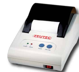
SpectraAnalyzer Printer (10097)