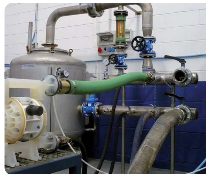
FLEXODAMP Installed in air operated diaphragm pump