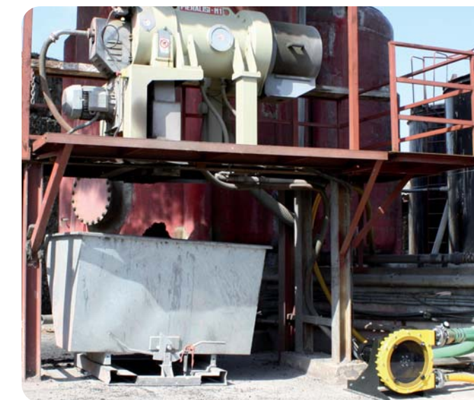
FLEXODAMP Installed in peristaltic pump