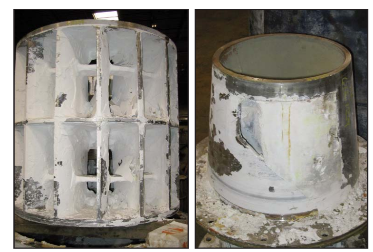
Calcium coated rotor and cone